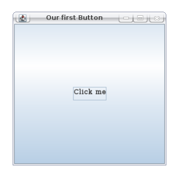
Figure 2: A JButton in a JFrame.

This method determines how the GUI behaves when you leave the window. Using JFrame . EXIT_ON_CLOSE exits the application using System.exit() method.